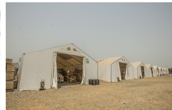
A logistics base for humanitarian supplies in Sierra Leone