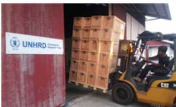
Cargo being loaded in Kuala Lumpur